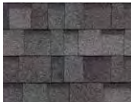
Estate Gray †