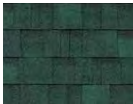
Chateau Green †

Not Available in Service Area C (see map).