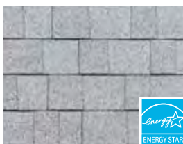
Shasta White †

Not Available in Service Area A (see map).