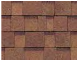
Desert Tan †