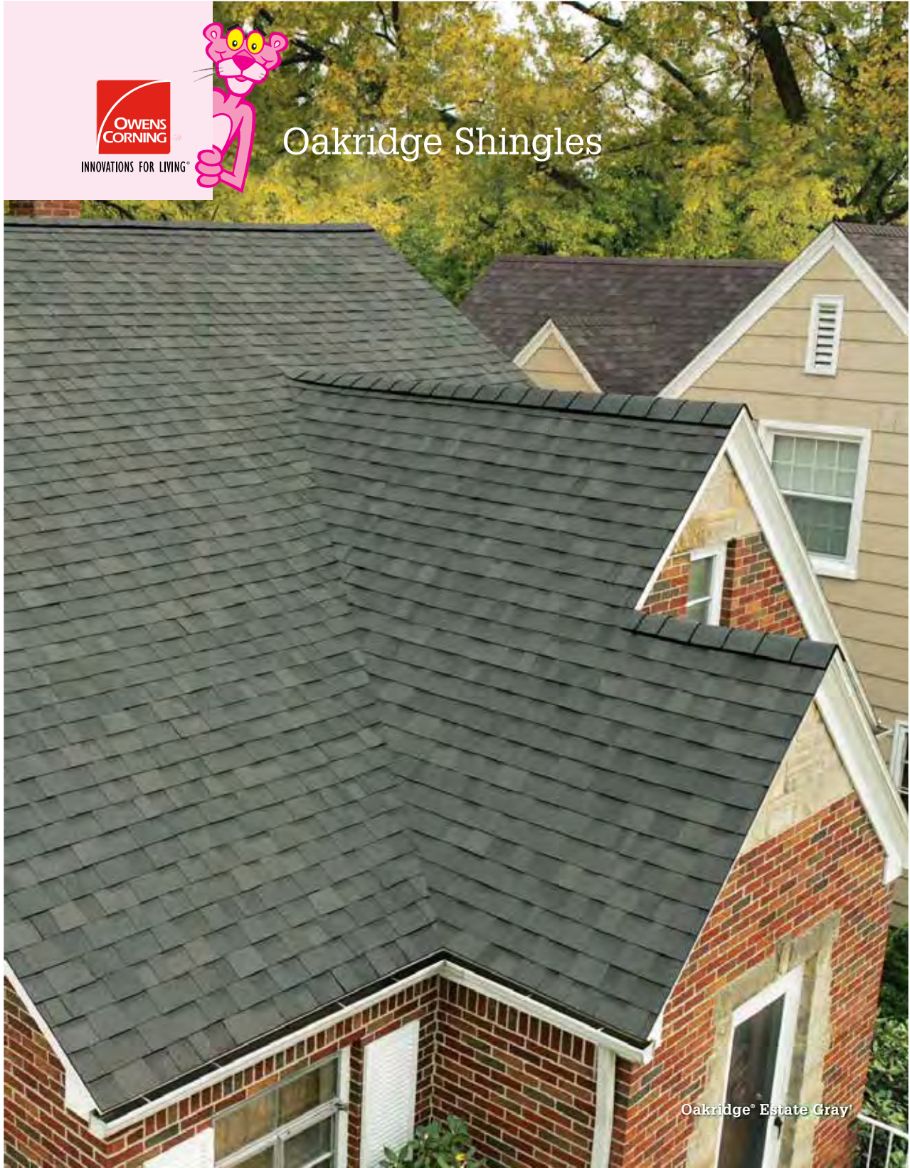
Oakridge® Estate Gray