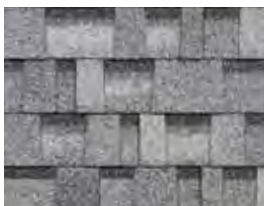
Sierra Gray †

Not Available in Service Area C (see map).